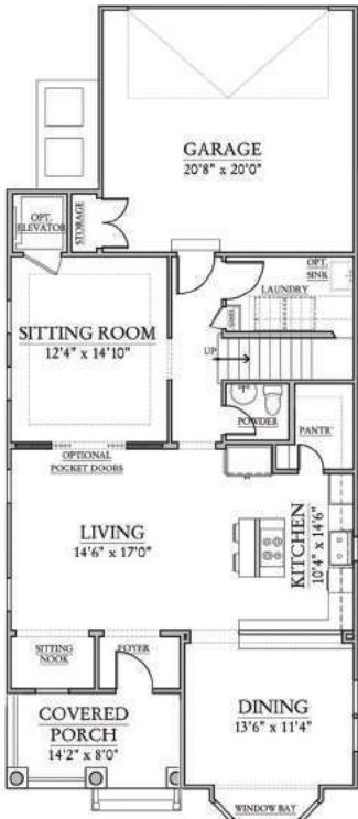
OPT. ELEVATOR/SITTING ROOM - FIRST FLOOR