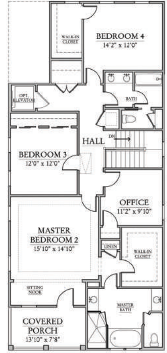
OPT. GOLF CART/ELEVATOR/SITTING ROOM - SECOND FLOOR